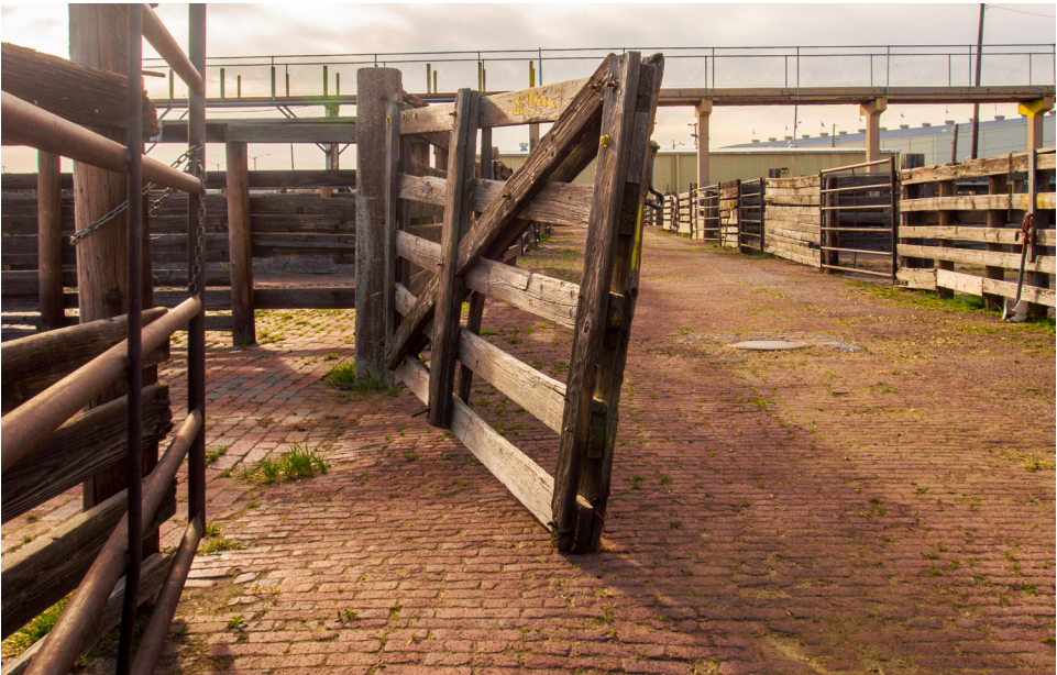
BRICKS SALVAGED FROM THE HISTORIC YARDS