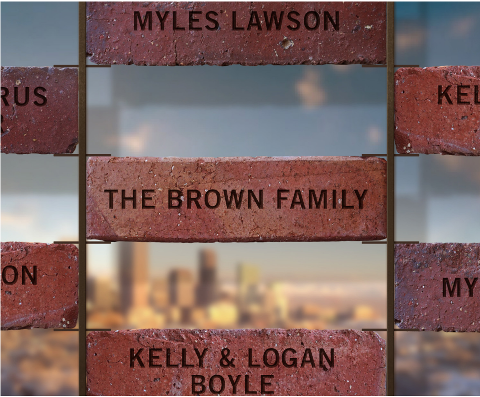
DETAIL OF BRICK FROM THE YARDS REPURPOSED AS A HERITAGE ART DISPLAY