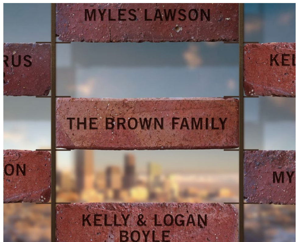
DETAIL OF BRICK FROM THE YARDS REPURPOSED AS A HERITAGE ART DISPLAY

The Legacy Brick program carves out a place for you or someone you love in the new National Western Center, and your gift will help us realize, in bricks and mortar, this vital new centerpiece of the West.